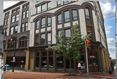
Grand Rapids Brewing Co. | 2022

Grand Rapids Brewing Co. is the oldest in the city. It was built in 1893 off Michigan/Ionia Street after 6 local breweries combined to form one large brewery. It reopened in 2012, after being closed for 79 years due to the prohibition.