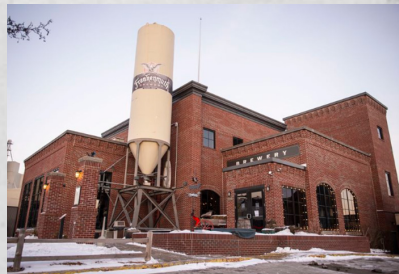
Frankenmuth Brewery | 2022